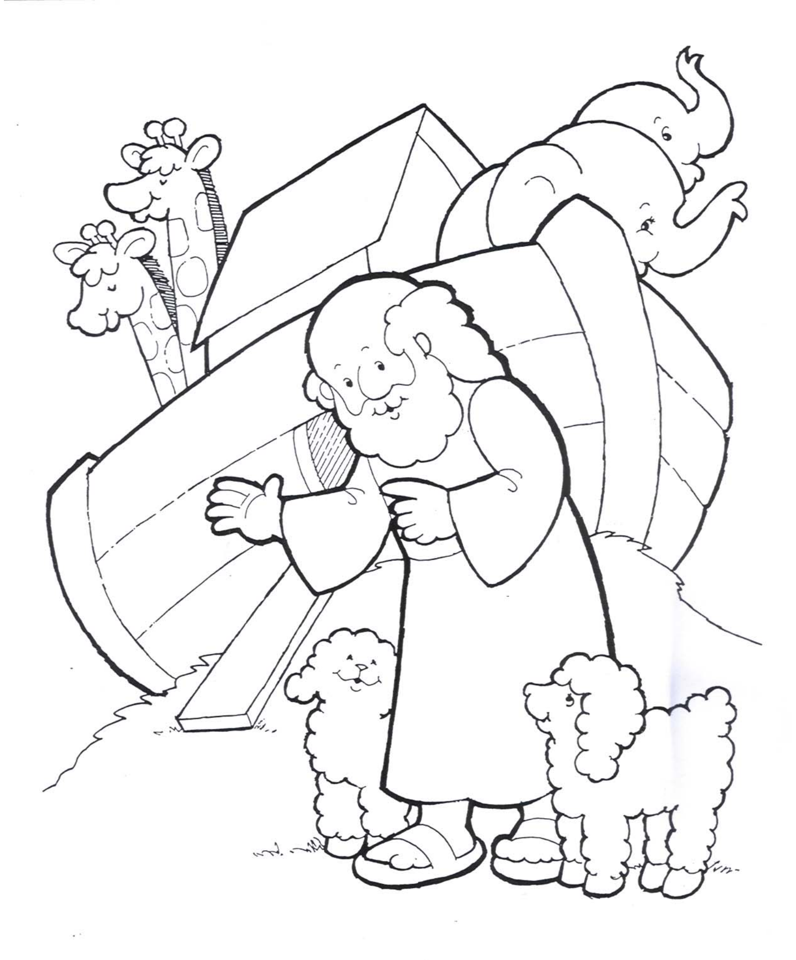
Animals boarded Noah's ark two by two.