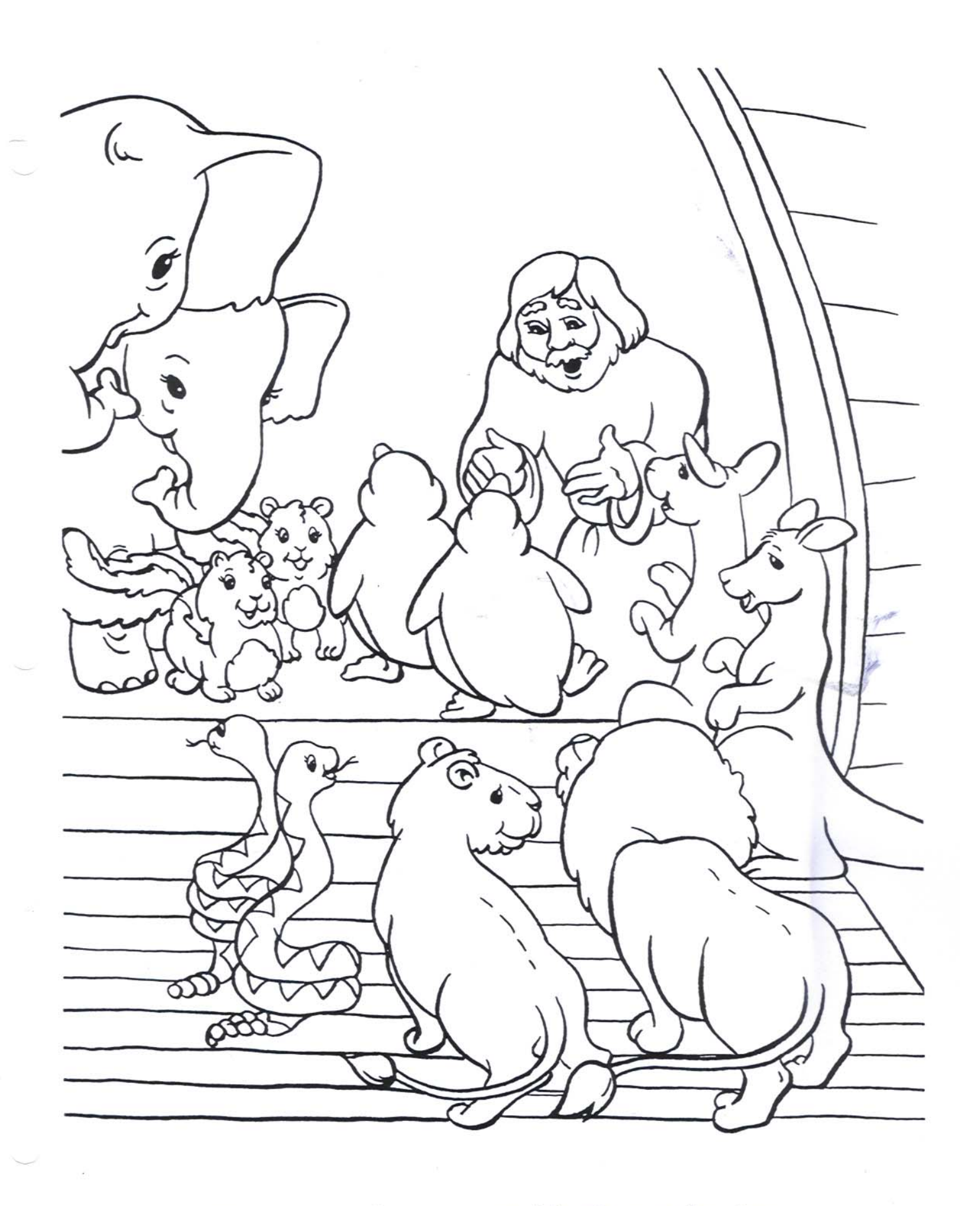
The animals came to Noah two by two.