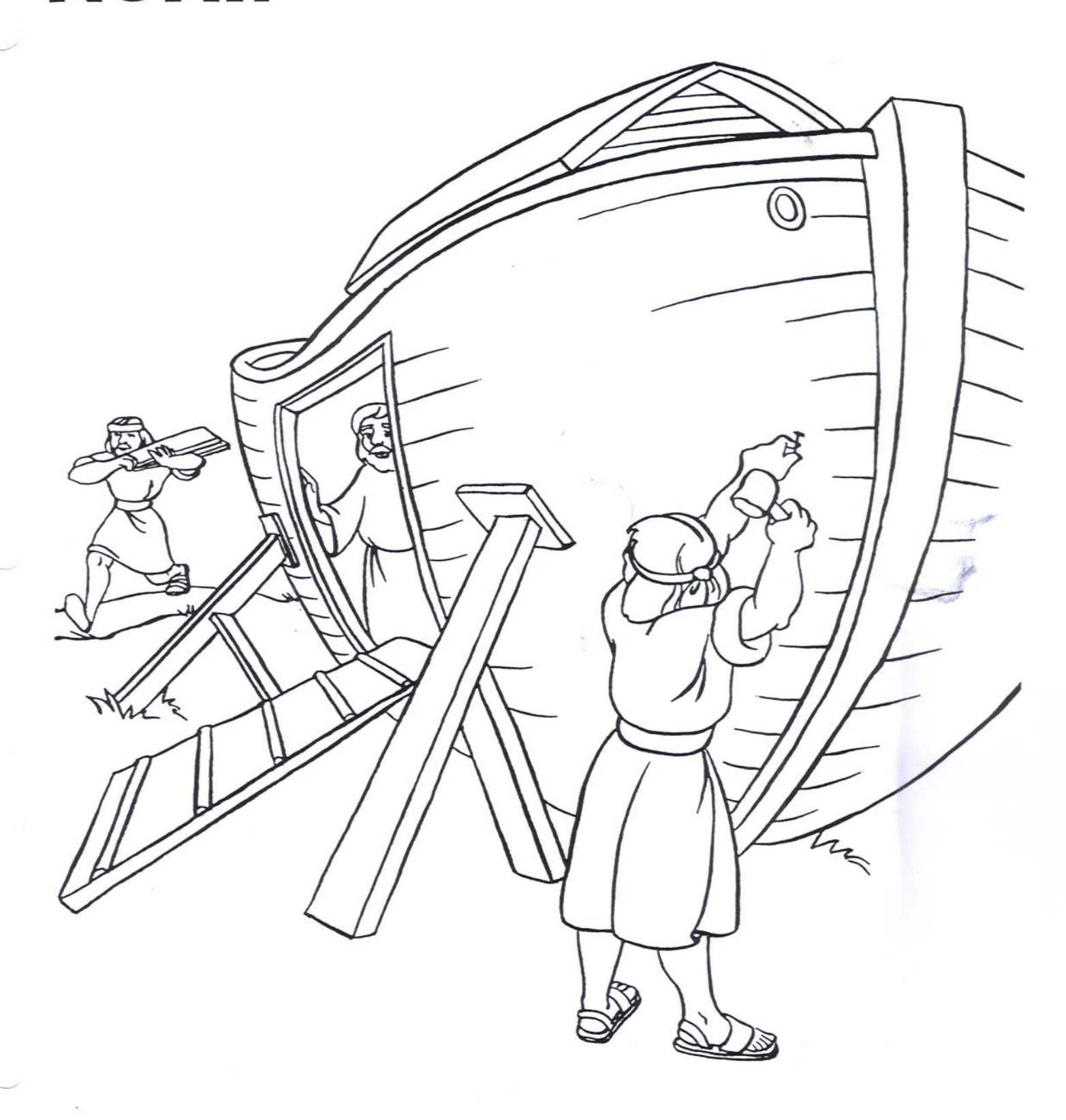
God told Noah to build a big boat.